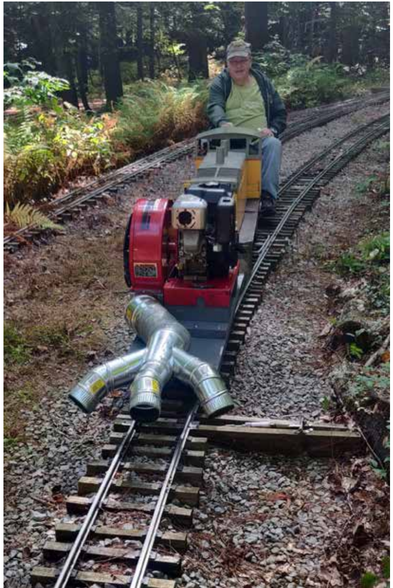
Ghidorah with it's three heads!